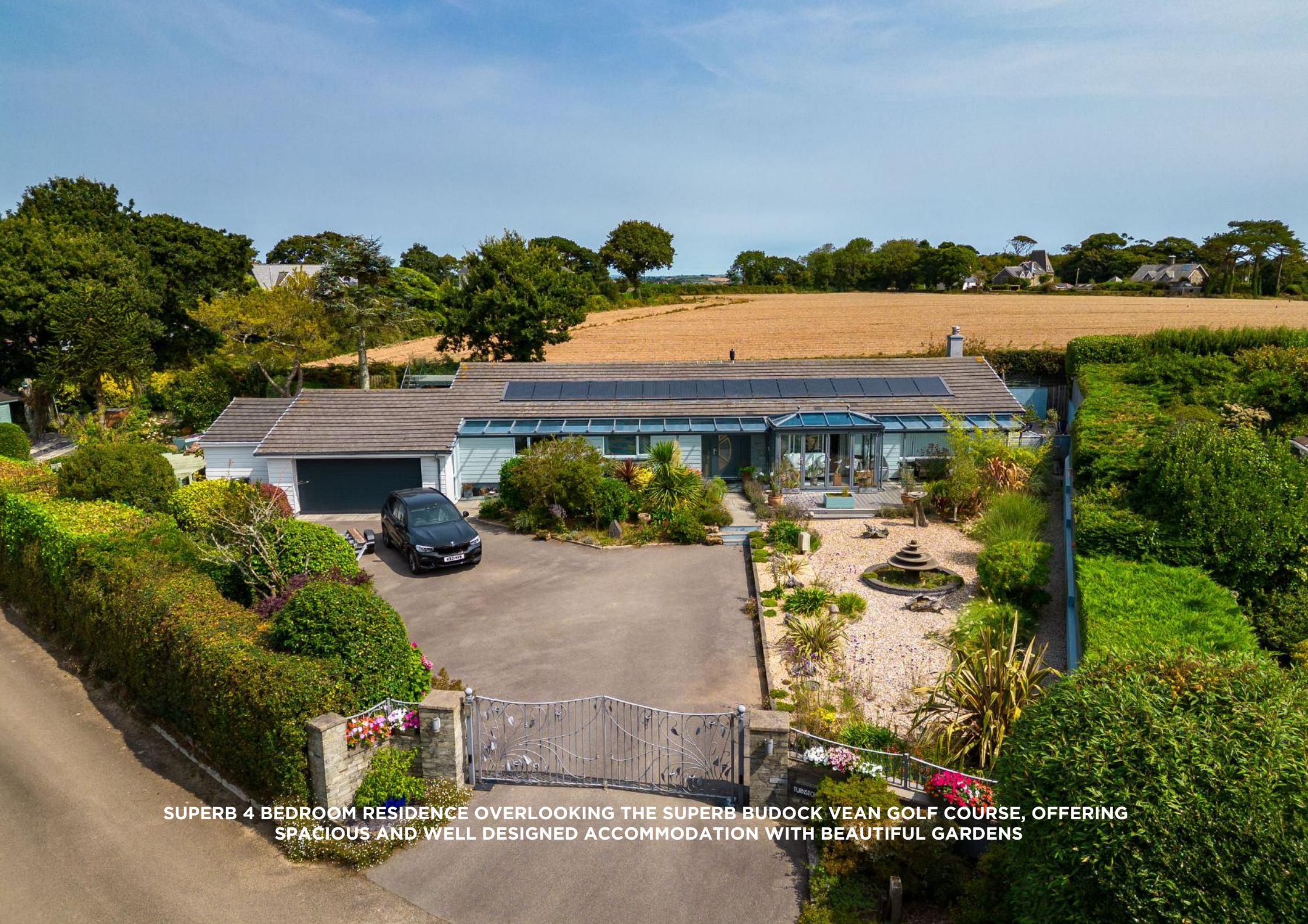
SUPERB 4 BEDROOM RESIDENCE OVERLOOKING THE SUPERB BUDOCK VEAN GOLF COURSE, OFFERING SPACIOUS AND WELL DESIGNED ACCOMMODATION WITH BEAUTIFUL GARDENS